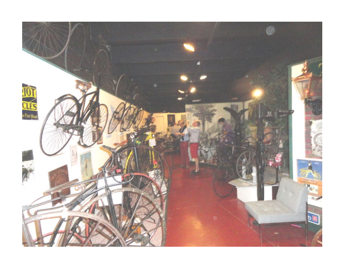
National Cycle Museum