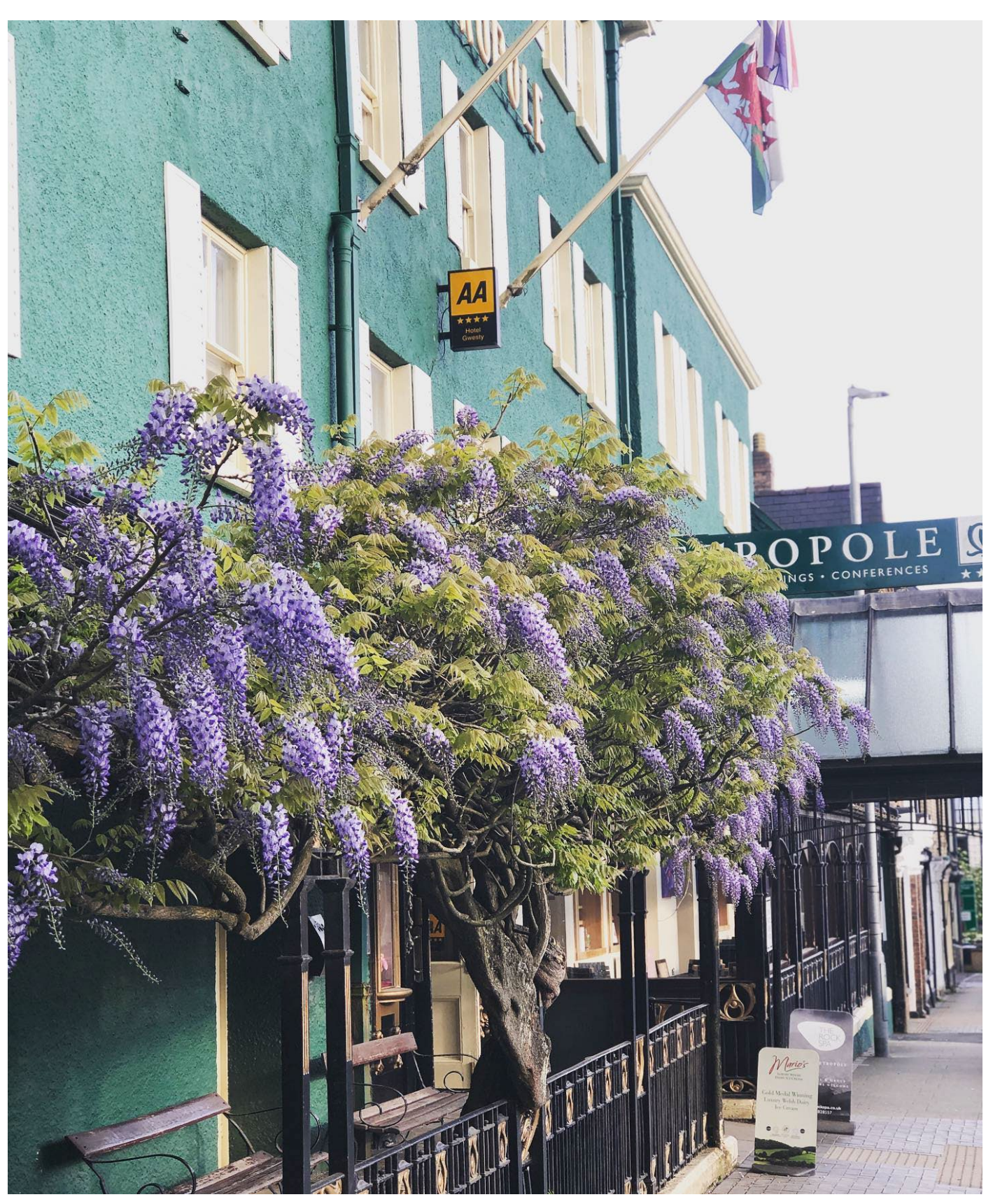
You can sit outside with a drink and watch the world go by!