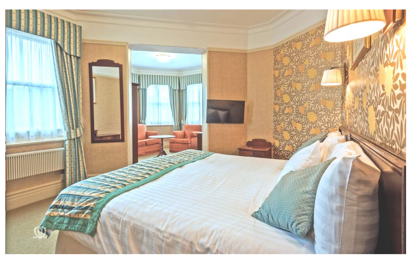
All bedrooms are ensuite but the building is Victorian so layout varies. Above shows one of the tower rooms.