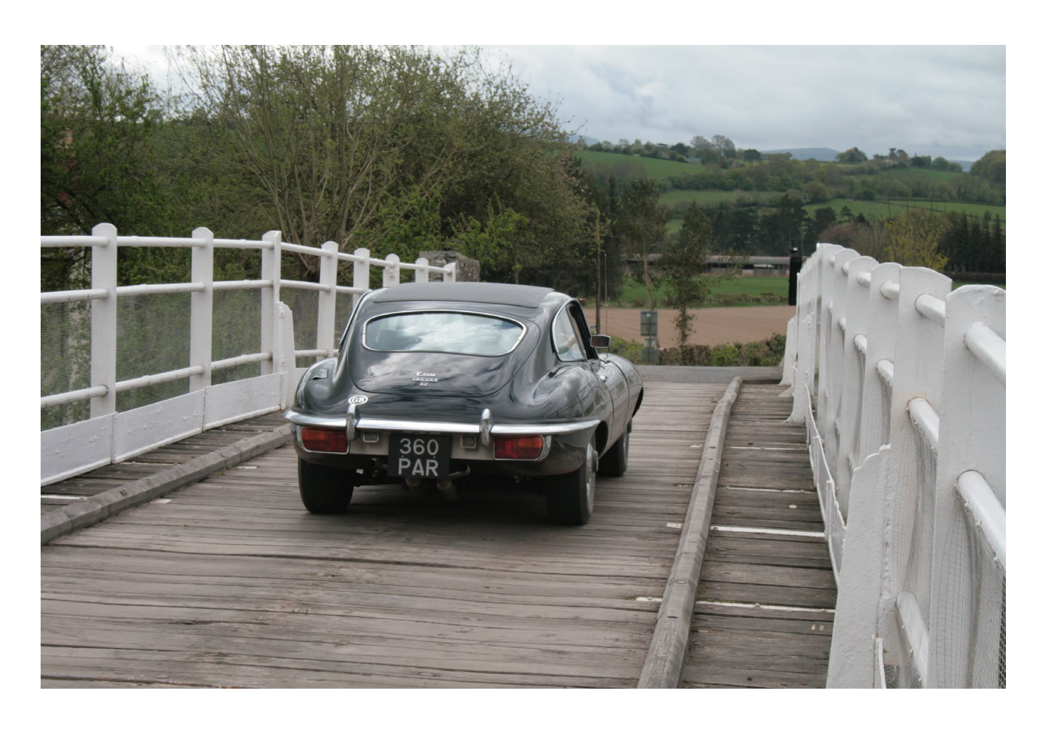
All marques and ages welcome!