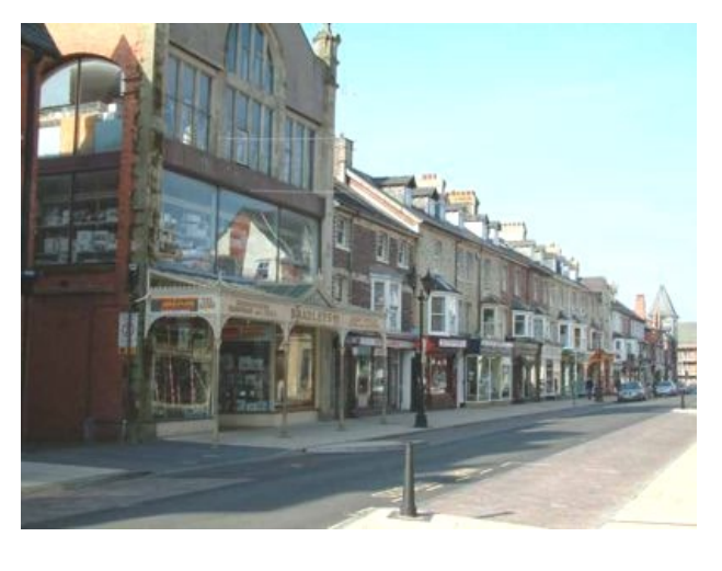
Llandrindod Wells Street