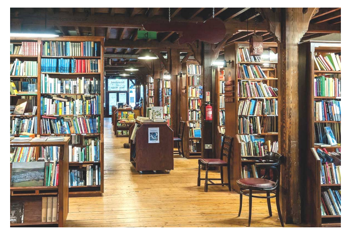
Hay-on-Wye Book Shop